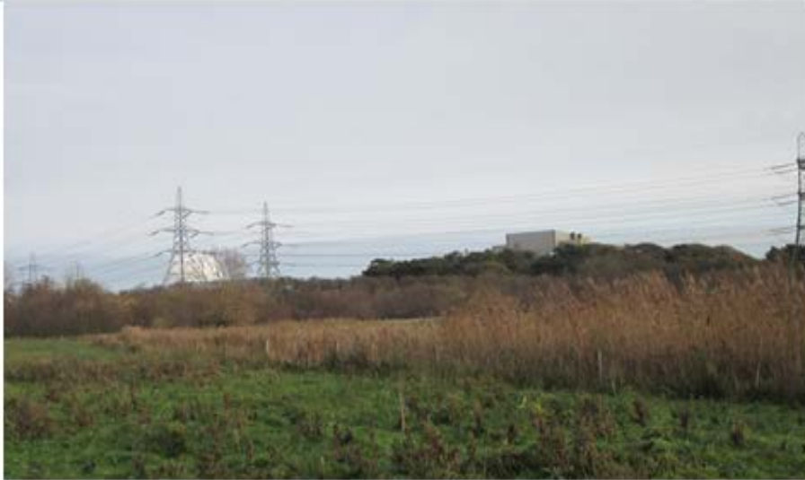
19th November 2020

Views of Sizewell A & B from Bridleway 19 before and after the felling of Coronation Wood, clearly exposing the industrial complex and destroying the sound buffer.