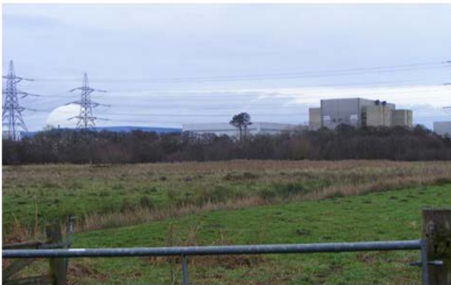
24th January 2021 Last tree standing waiting for bat mitigation licence. Clearly exposes dry fuel store and Sizewell A.